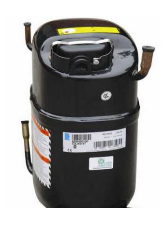
France Tecumseh compressor